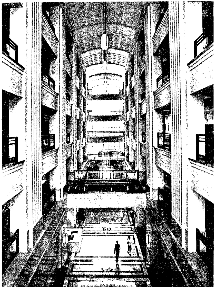
The building is divided by a 40-foot-wide, five-story atrium with three walkways connecting the building's upper floors.